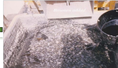
6. Addition of Bitumin