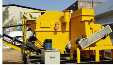
3. Mini Hot Mix Plant