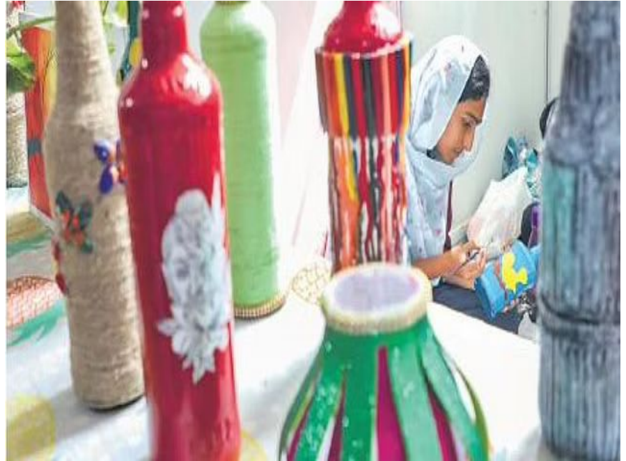
The installations made from recycled waste plastic bottles on display on Kanakakunnu premises

A state level exhibition of alternate products with the participation of vendors in this field from across the state was held in January 2020 as part of Suchitwa Sangamam Campaign 2020.