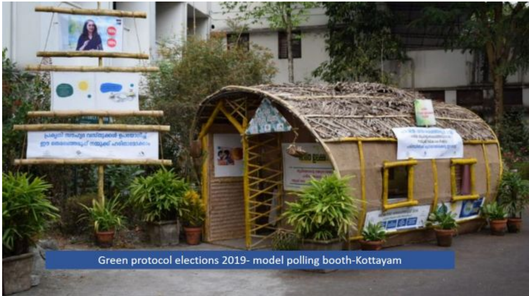
Green protocol elections 2019- model polling booth-Kottayam