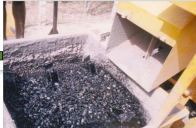
7. Aggregate – Plastic – Bitumin Mix