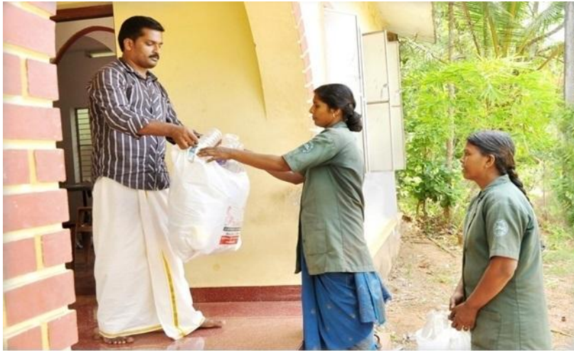
Plastic collection from house - Kadirur GP

Harithakarmasena (HKS) at LSGI level (Each ward 2 members)