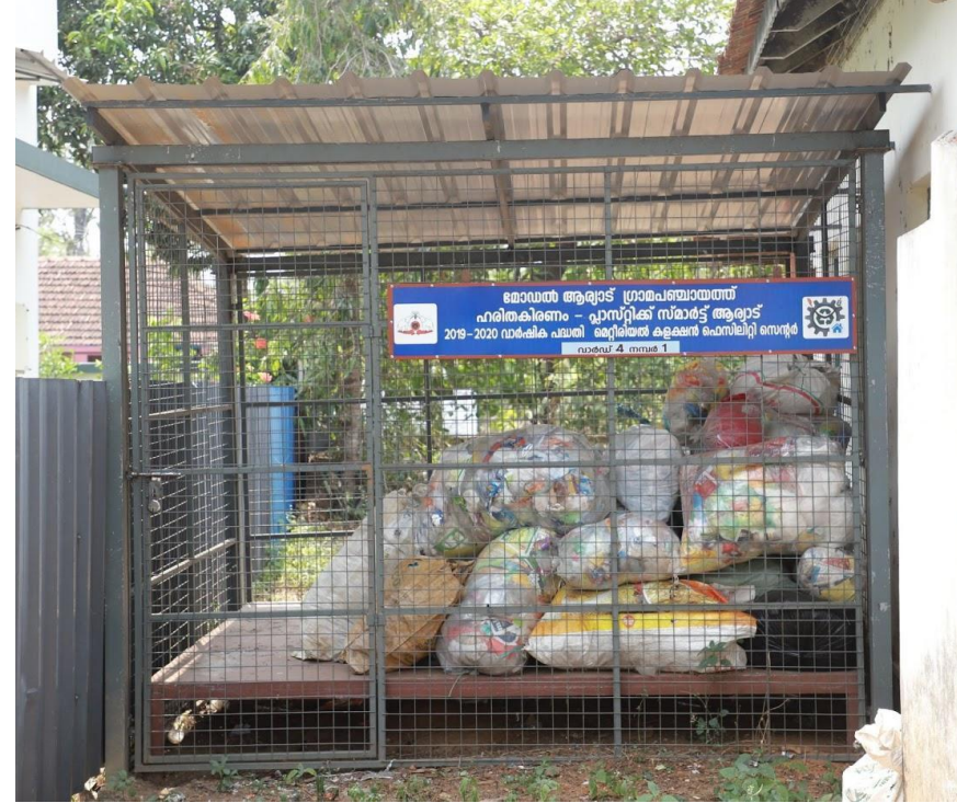
MCF & Mini-MCF in Aryad GP in Alappuzha Dist.