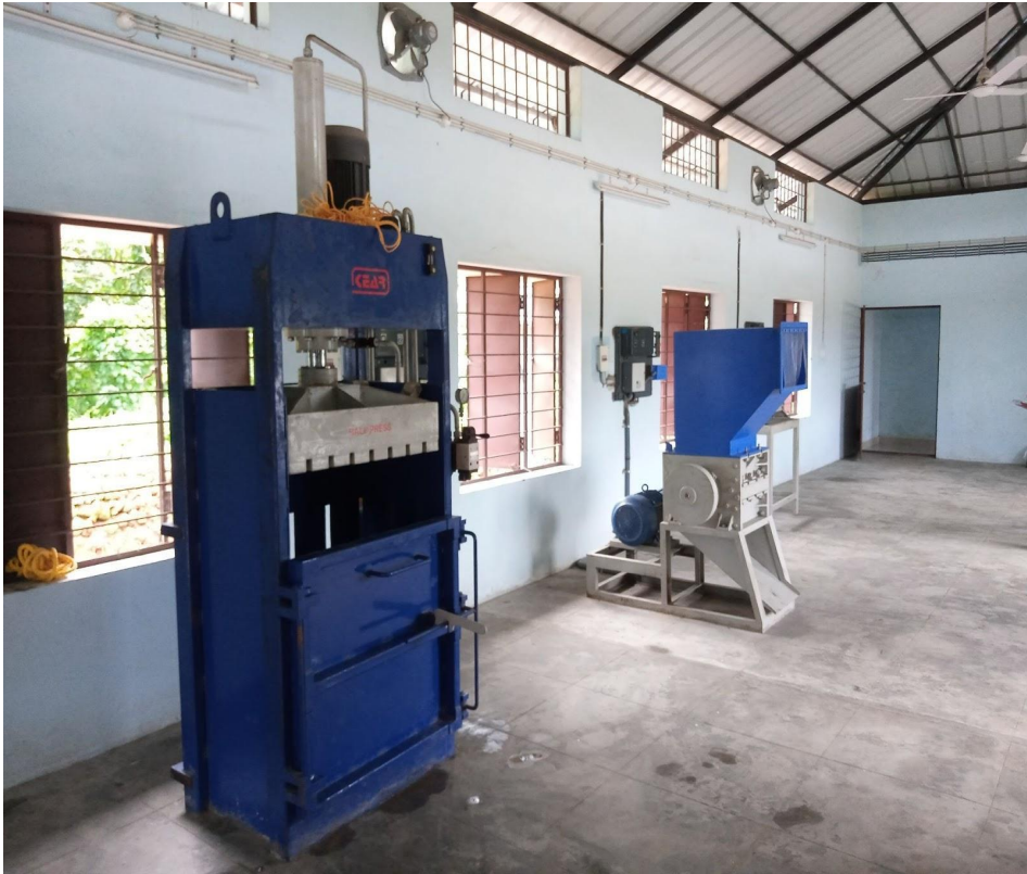
Resource Recovery Facility in Mundur BP in Palakkad