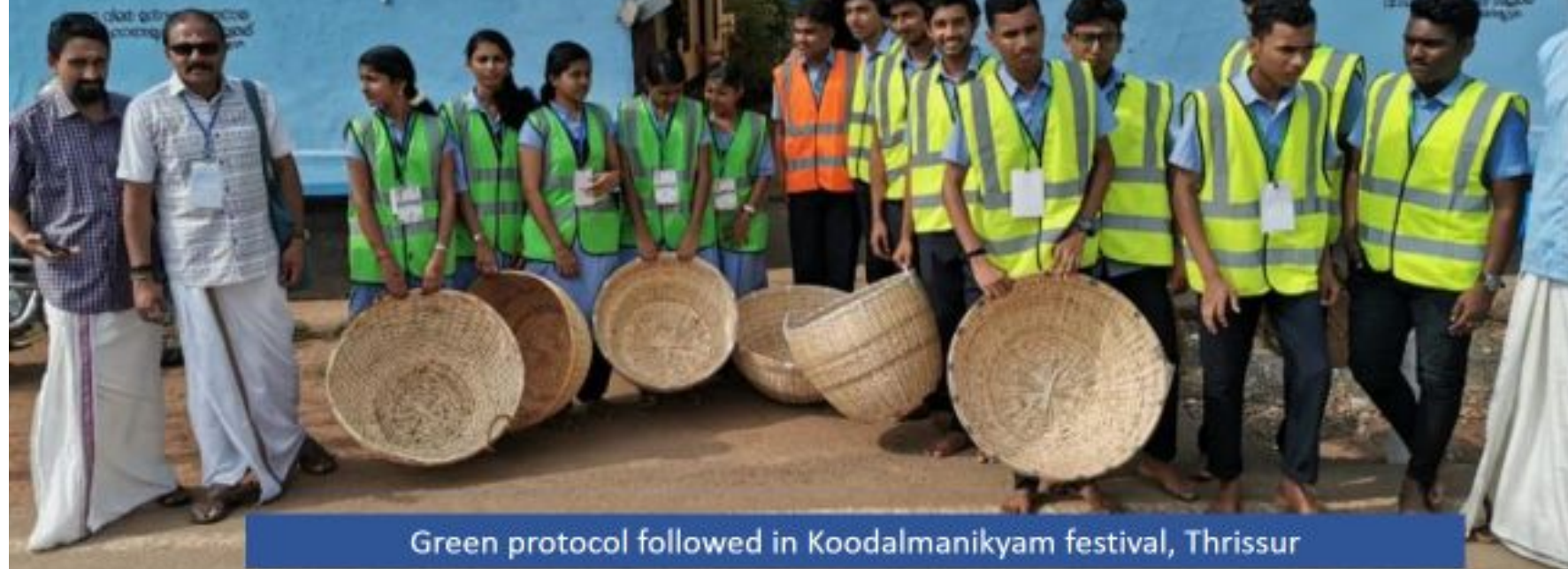
Green protocol followed in Koodalmanikyam festival, Thrissur

Ph : 9449 302843 (OFFICE) 9449 302821 (TUMPLE) Website: www.koodalmanikyam.com, E-mail: contact@koodalmanikyam.com