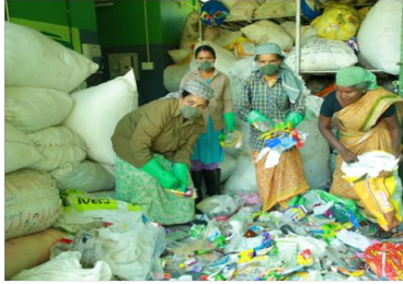
1. Cleaning of Plastic waste