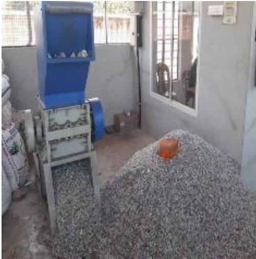
Plastic shredding unit