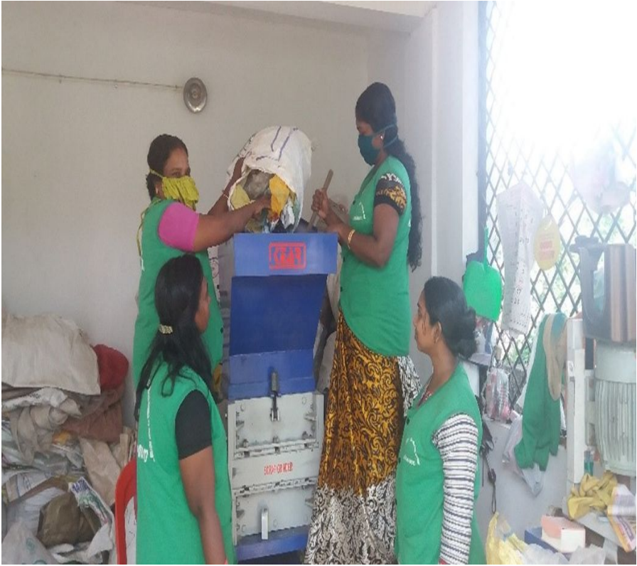
Resource Recovery Facility in Bharanikkavu BP in Kollam