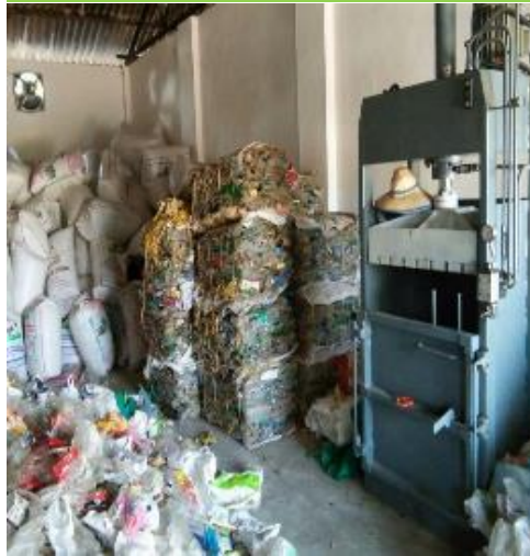
Plastic bailing unit