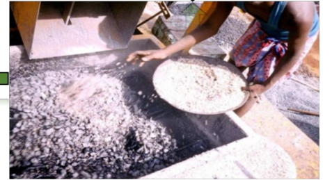
5. Addition of Plastics