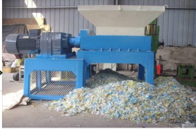
2. Shredding of Plastic