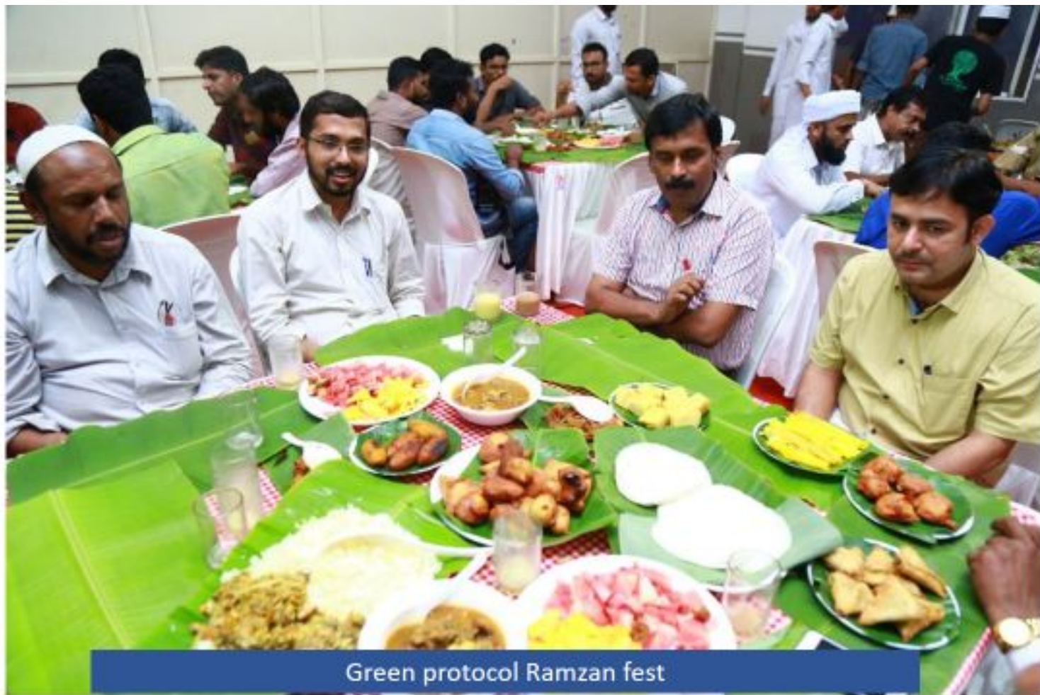
Green protocol Ramzan fest