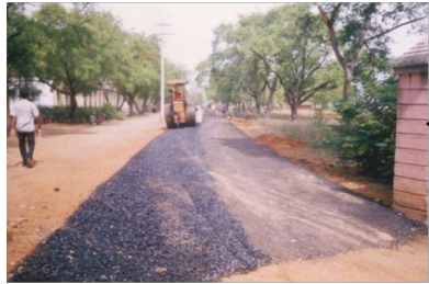
8. Road Layering