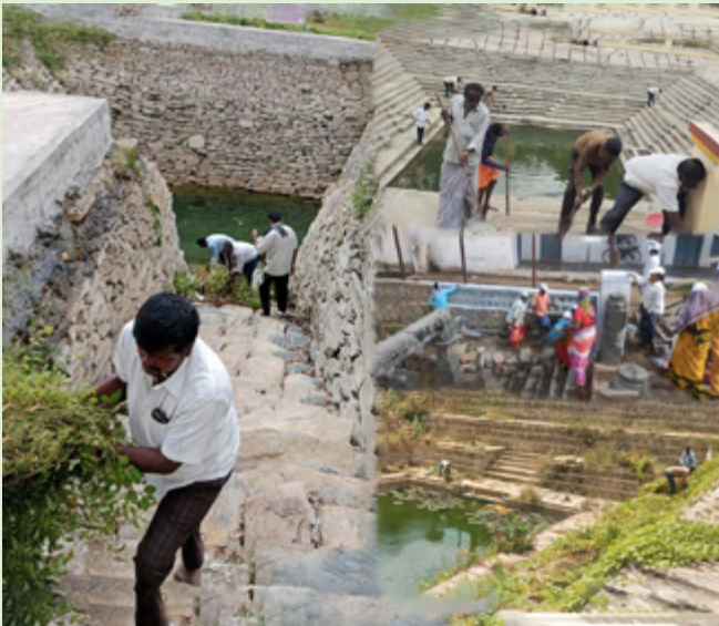
Rejuvenation of Temple Tanks, Karnataka