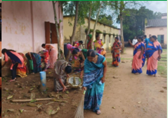
Hygiene awareness campaign, Assam