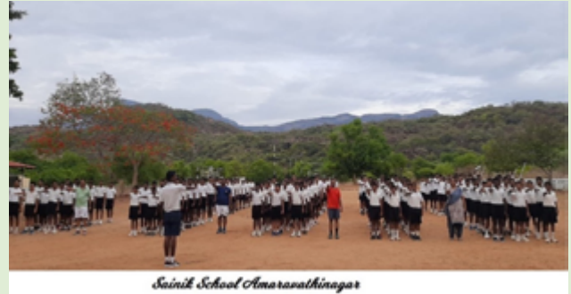
Sainik School Amaranathinagar

In the spirit of Swachhata Hi Seva, Sainik Schools across India united for various grand cleanliness drives. Students were involved in various activities such as the Pledge to keep India 'Clean and Green'. They spread the message of achieving a cleaner and healthier India. The Defence Secretary inaugurated a 'Mechanised Cleaning' programme to ensure faster and greener cleaning process through machines, at BEML Limited in Mysuru of Karnataka on 1st October. Under the 'Swachhata Hi Sewa' campaign, BEML has been carrying out a number of activities such as weeding out old records, cleaning Krishna Raja Sagara dam and displaying posters in school and college premises to create awareness about the need to ensure cleanliness. Other Defence Public Sector Undertakings across the country are also carrying out similar cleanliness drives at their premises as part of the campaign.