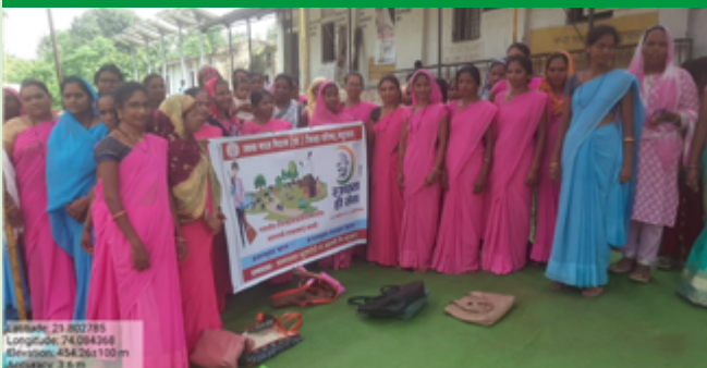
Water bodies cleanliness drives, Maharashtra