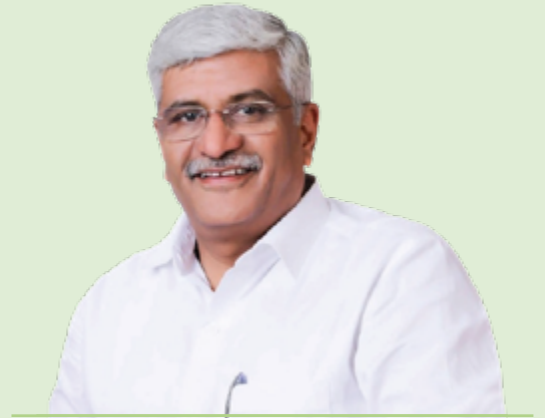
Shri Gajendra Singh Shekhawat Union Minister, Ministry of Jal Shakti

“ This year marks 9 years of the Swachh Bharat Mission. The achievement of 75% ODF Plus villages is a significant milestone for India, as the country has moved from ODF to ODF Plus in Swachh Bharat Mission Grameen- Phase II. The SBM-G programme has been instrumental in improving the health and well-being of millions of people across the country. Swachhata Hi Seva has accelerated the ODF Plus momentum through Shramdaan activities through Jan-andolan towards achieving the targets and goals of the Swachh Bharat Mission. ”