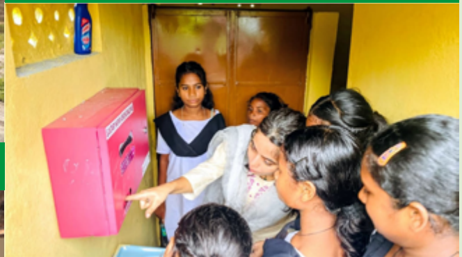
Hygiene awareness campaign, Assam