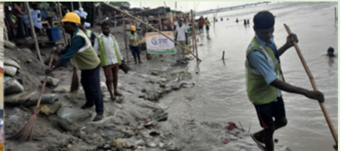
Ganga ghat cleaning, Bihar