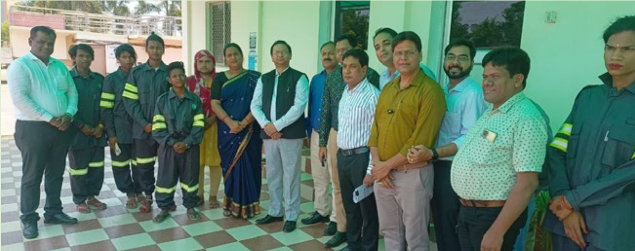
JS&MD-DDWS visited an FSTP of 75KLD, run and managed by a transgender SHG group in Bhubaneswar, and the Material Recovery Facility in Hasanpur Village of Sujanpur GP and interacted with the community.