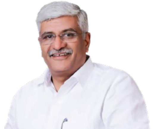
Shri Gajendra Singh Shekhawat Union Minister, Ministry of Jal Shakti