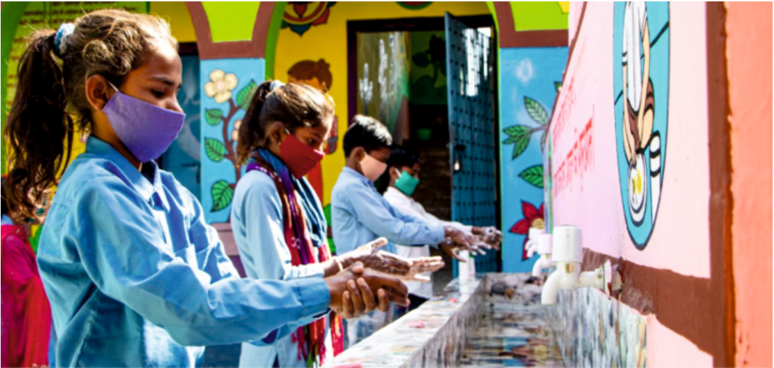
Figure 3: Students practicing handwashing in a rural school