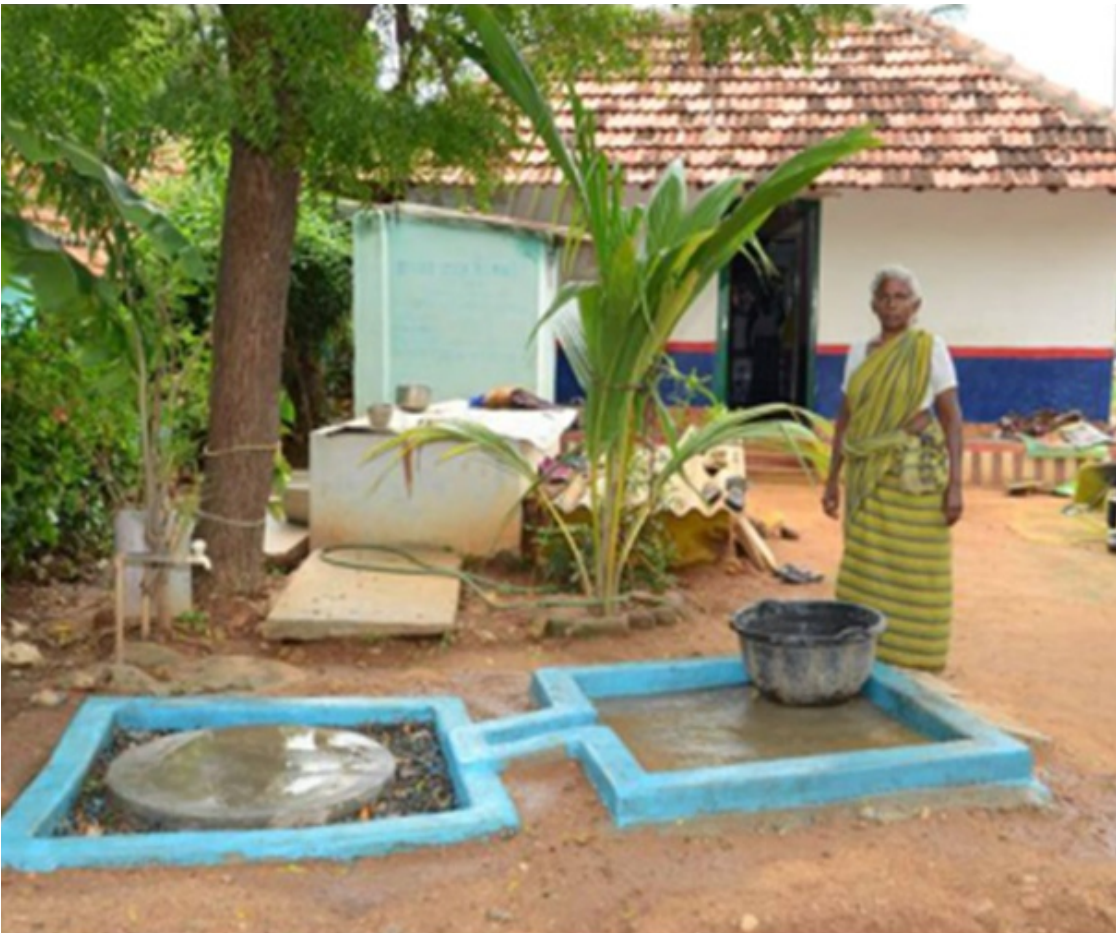
Figure 10: Soak pit for Greywater Management, Tamil Nadu