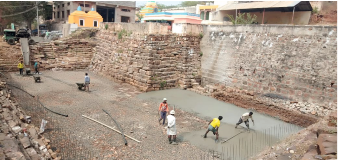
Figure 5: Local community rejuvenating step well