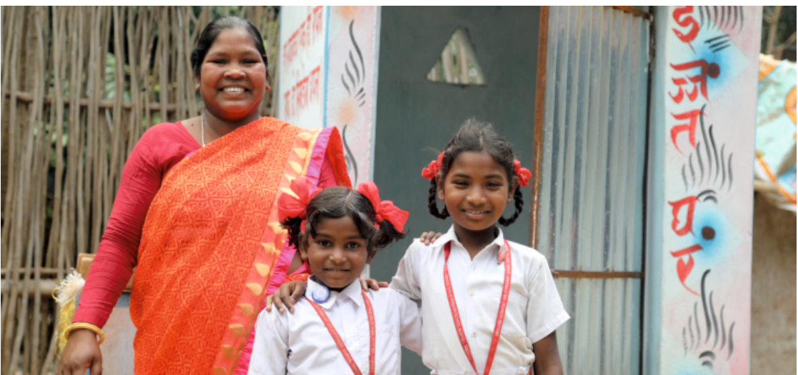
Figure 2: Mother and her two kids outside their household latrine

1.6. Villages across the country will witness a transformation in the next four years under Jal Jeevan Mission (JJM) with assured tap water supply to every home,