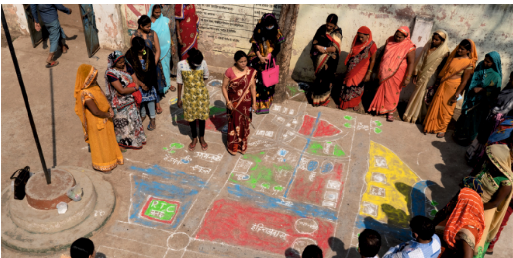
Figure 6: Water resource mapping in a rural village

7.1. Effective from the financial year 2021-22, the Panchayats/ traditional bodies are required to maintain their account transactions using the 15 th Finance Commission tied grant in eGramSwaraj, and make all vendor/service provider payments through the eGramSwaraj-PFMS interface only. The auditing of the annual accounts is also to be mandatorily carried out on the 'Audit online' application of MoPR. From 2023-