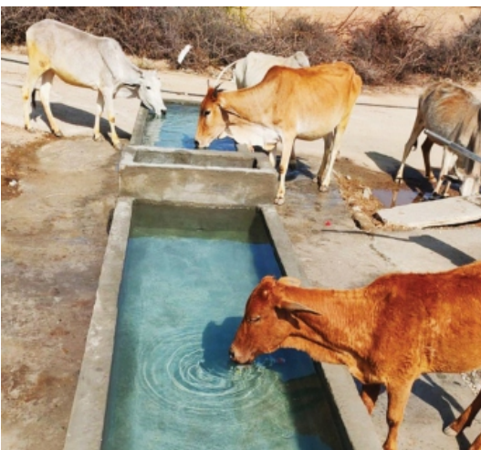
Figure 4: Cattle trough

5.2 Apart from the households, Gram Panchayats are to ensure the provision of potable water supply and sanitation services in public institutions like schools, Anganwadi centres, Ashramshalas (tribal residential schools), health centres, GP buildings, public places like weekly haat/ bazar, mela ground, bus stand, playground/ sports complex, etc. Gram Panchayats must focus on greywater treatment, reuse and ensure that untreated greywater is not released in water bodies or rivers. The indicative items of works/ activities that may be taken up under the tied grant is given in Annex–III .