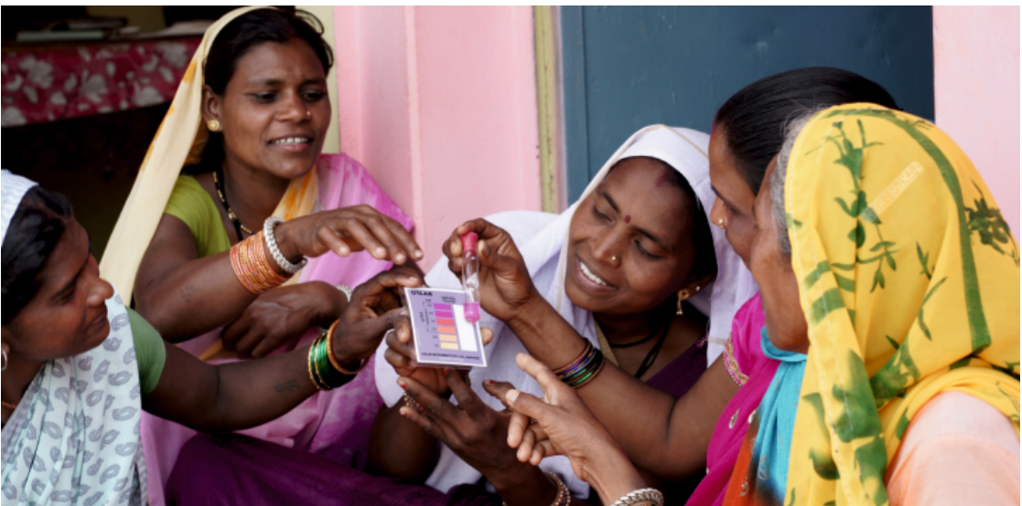
Figure 7: Women testing water quality using Field Test Kit (FTK)

9.5 The 15th Finance Commission in Chapter 7 of its Final Report for the period 2021-22 to 2025-26 has inter alia recommended tied grants for supporting and strengthening the delivery of basic services which are national priorities like Drinking water for all, sanitation, etc. The Government of India has also launched some schemes aimed at similar outcomes like Swachh Bharat Mission Grameen (SBM-G), Jal Jeevan Mission, etc. In order to sustain the achievements