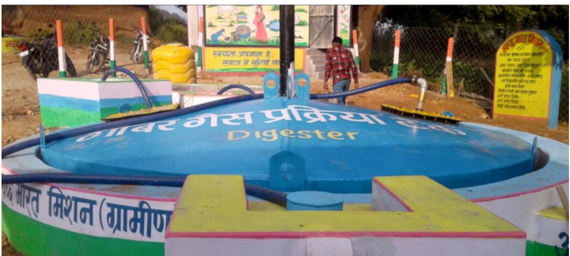
Figure 9: Bio-digester under GOBARDHAN scheme