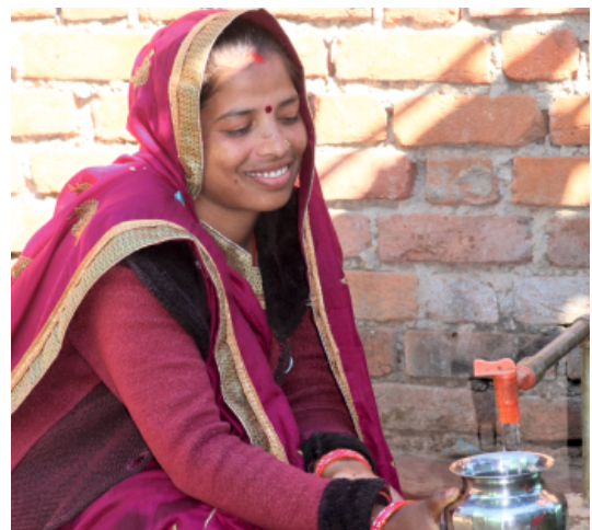
Figure 1: Woman with her household tap water connection

1.3. The 73rd Constitutional Amendment Act of 1992 added Part IX to the Constitution of India, i.e., 'The Panchayats' and also added the 'Eleventh Schedule', the latter consists of 29 subjects wherein the Panchayats are given administrative control. This was one of the important steps in strengthening the local self-governments and developing a 'responsible and responsive' leadership at village level. Under the 'Eleventh Schedule', two important subjects are 'drinking water' and 'health and sanitation, including hospitals, primary health centres and dispensaries'. To support